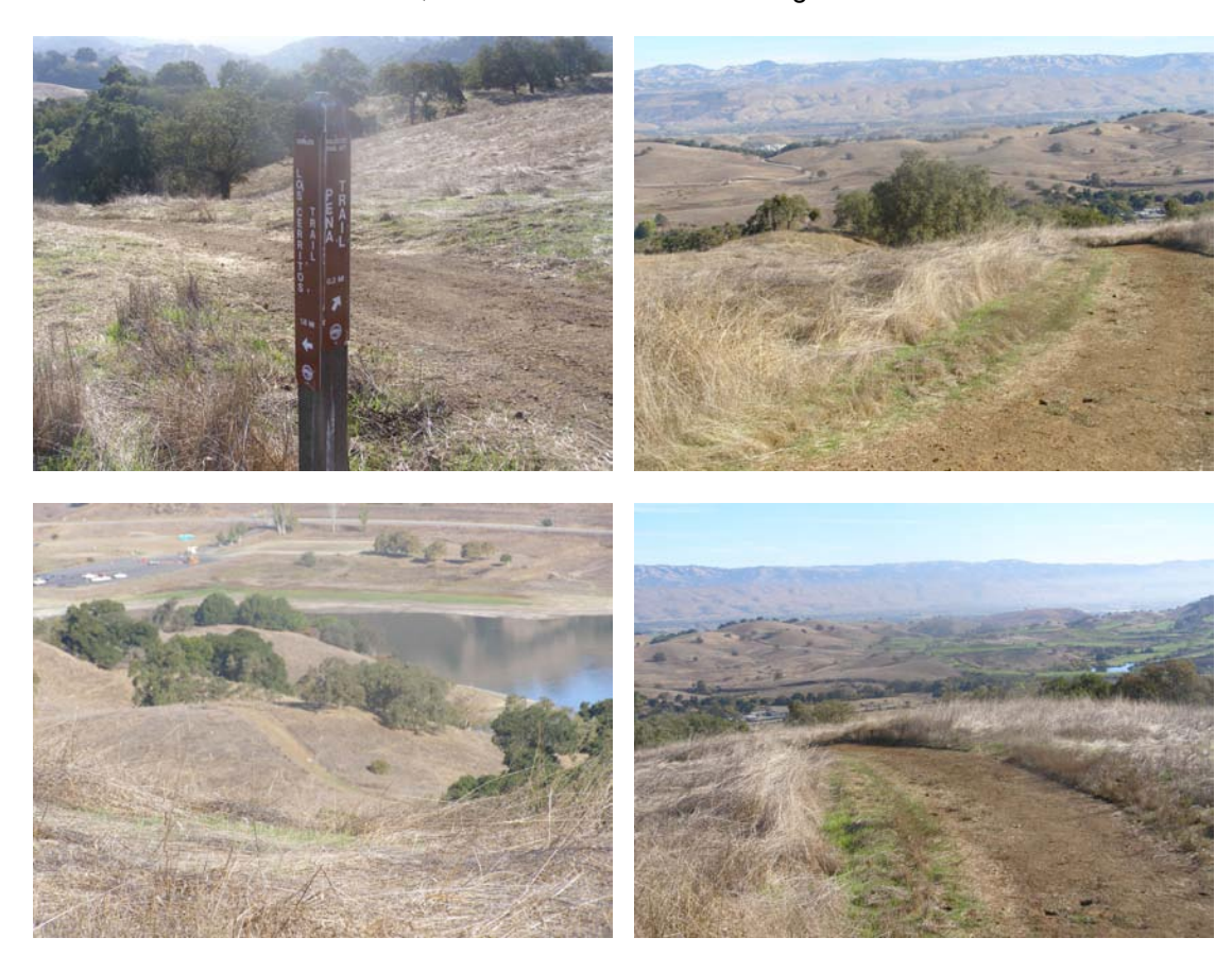
Stop 4: Calero Bat Inn

With the closure of the Pena Trail, the Los Cerritos Trail would be re-aligned to connect with the Vallecitos Trail to the southeast, and would follow the lake edge contours to the west.